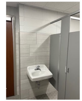
Upper Commons: Renovated bathroom for ADA Compliance