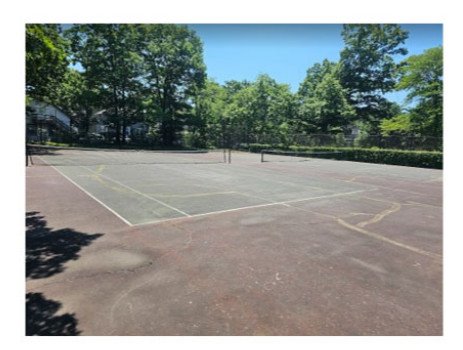
Before: Significant cracks