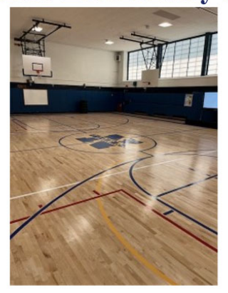
Repaint & Refinished Gym floor