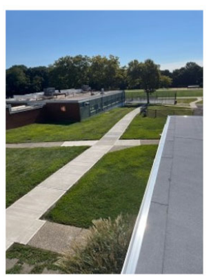
New walkway from main office hallway to recess areas