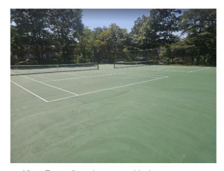
After: Resurfaced courts with the addition of Pickleball lines to the Tennis lines <sub>18</sub>