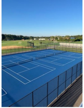
After: 5 dedicated tennis only courts, 1 pickleball court and 2 hybrid tennis/pickleball courts. This increases the tennis court capacity to 7 from 6 allowing for a full tennis tournament to be played at home.