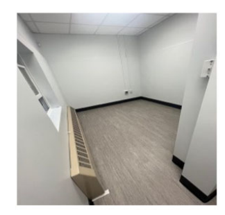
After: Removed tiles and installed drywall, new flooring, fresh paint, and ceiling grid/ lighting