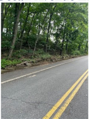
Before: Retaining wall on Dogwood