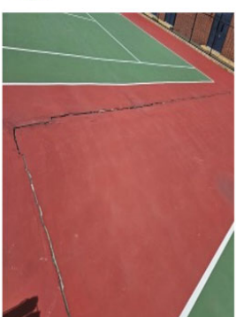
Before: Significant cracking