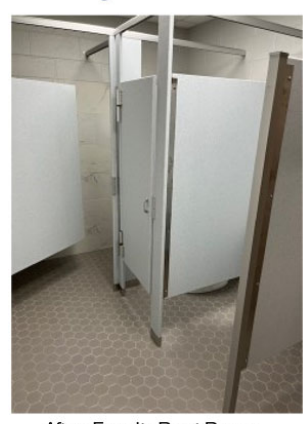
After: Faculty Rest Room