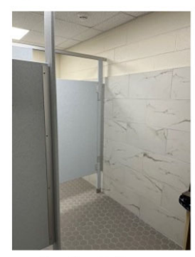
After: Faculty Restroom