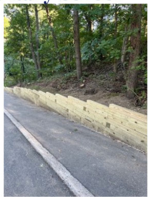
After: Installed retaining wall