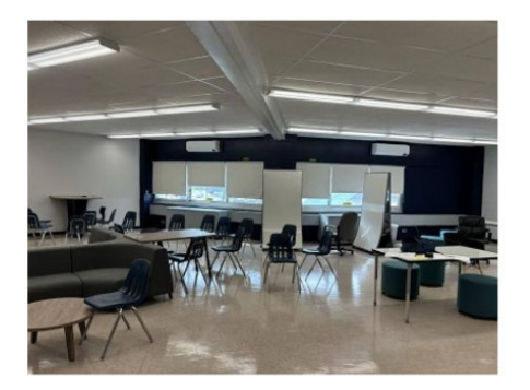
2<sup>nd</sup> floor 'Diad': Collaborative learning space